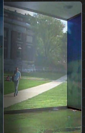
Max-Planck Interactive Visitor Center – designed by VITOLI and Schukat & Reuter