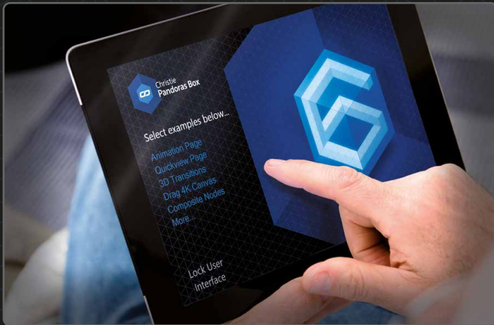
Web Server application example

You can integrate a compilation of many nodes in a reusable, custom node for future use. This drastically reduces the number of nodes you need, makes it easier to make changes to the system, and enhances the overview of extensive node systems.