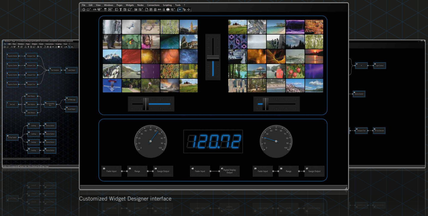
Customized Widget Designer interface

Widget Designer can unite combinations that were previously only imagined. You can now use an extensive number of supported protocols and external devices. For example, you can use camera tracking and motion detections to trigger network-based protocols or be translated to interact with file formats. You can now read and edit spreadsheets to update projected content, or use database content to schedule shows.