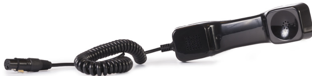
GHSA05 Handset Telephone Style